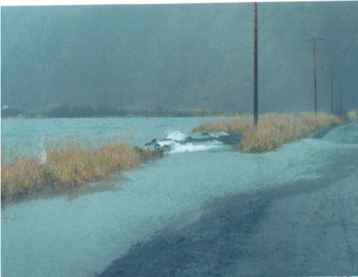
Photo 1: Old Harbor Estuary and Sitkalidak Strait nearly merge, impacting the spit road and utilities during a December 2002 storm.